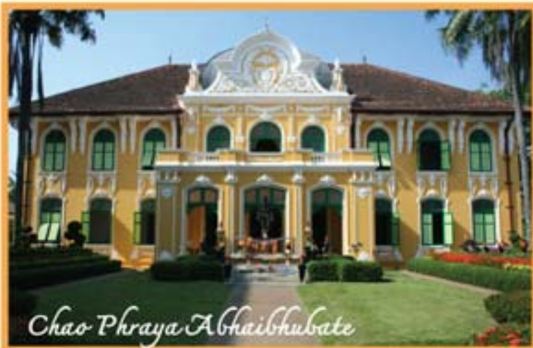
Chao Phraya Abhaibhuate