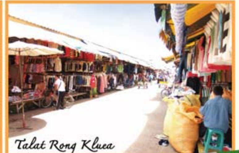
Talat Rong Kluea