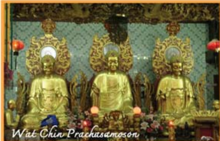
Wat Chin Prachasamoson